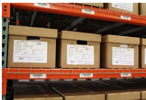
Each container is assigned to a specific shelf location in the Intersect Systems records database.