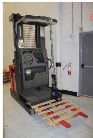
Heavy duty shelving, electric mobile lift: ready to receive containers.