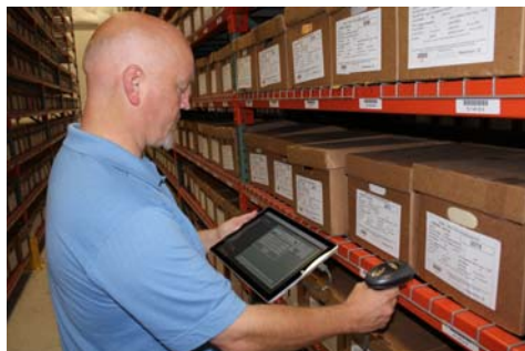
Containers can be assigned and unassigned with a Wi-Fi connected laptop or tablet from the warehouse floor, or containers can be assigned using a display of empty spaces from the central records management station.