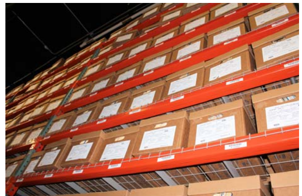
Total containers received, entered into database, labeled, and shelved in initial 90 day start-up period: 2,550

During the 90 day start-up period, Intersect and GPISD staff received, labeled, and entered over 2,500 containers into the GPISD records database — a substantial beginning accomplished in a remarkably short time. The new facility is rapidly approaching the initial 4,700 container capacity, and shelving has already been installed for the approximately 1,400 container expansion area (see facility layout on page 3).