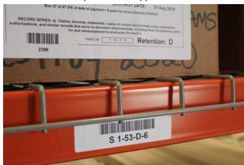
All shelf spaces are numbered with bar codes, and all containers are identified with a serialized ID.