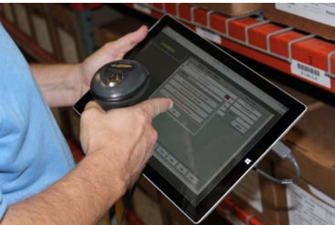
Intersect's RCAMS is compatible with touch screen laptop or tablet Windows-based systems. An additional feature of the bar code system allows verification of containers eligible for disposal before shredding.