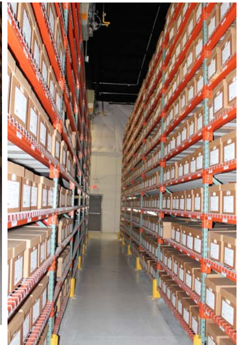
Warehouse capacity: 4,700 containers. Future expansion will add 1,386 containers.