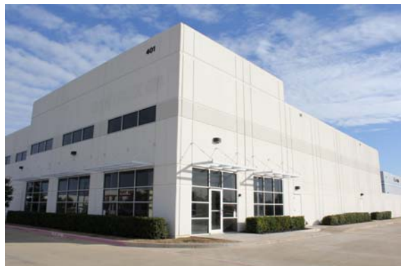
New GPISD Records Facility

In 2013, the school board made a decision to create a central records management facility with the dual purpose of