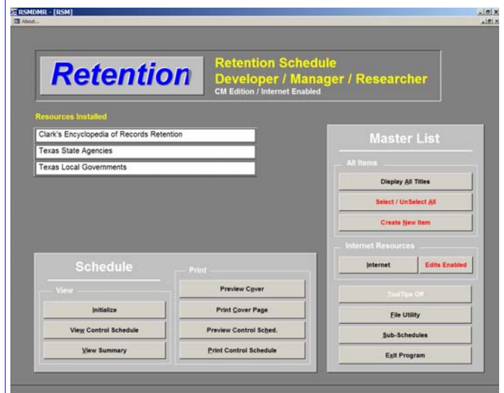
Main Menu of RS / DMR. Clark's Encyclopedia of Records Retention as well as the Texas State Agency and Texas Local Government schedules are loaded.

RS / DMR is primarily designed for commercial / business users. The Internet functions will also be added to the next release of the standard Retention Schedule Manager, designed for use by state agencies and local governments.