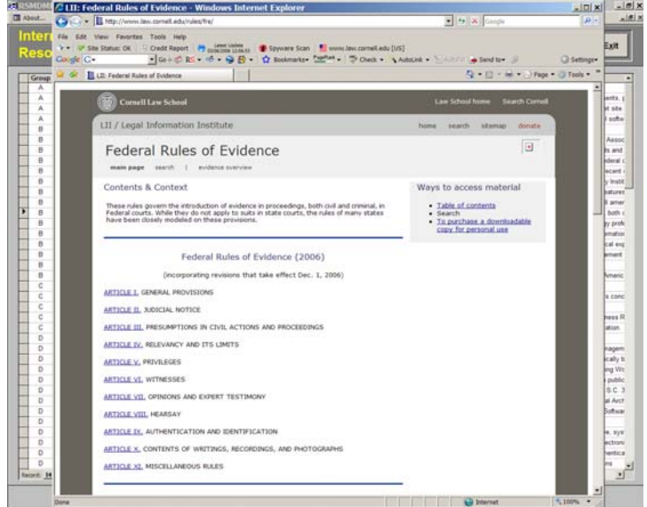
A number of relevant legal reference sites are included in the pre-entered URLs included in RS / DMR.

The RS / DMR update is available without charge to current Intersect users with a paid-up Annual Support Program.